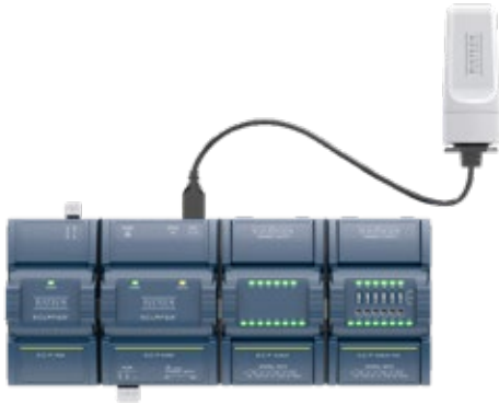
ECLYPSE Controller Series Connected IP and wi-fi product series