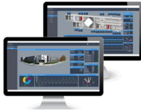
ENVYSION Responsive, web-based graphic design and visualization interface