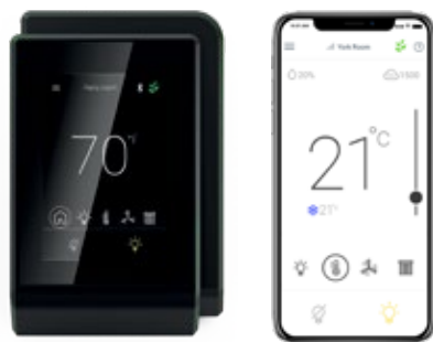
Allure UNITOUCH and my PERSONIFY State-of-the-art touchscreen user interface and mobile application